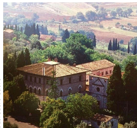
Oasi Sacro Cuore

In the Oasi you will also find a bar, large halls for common activities and for guests to meet, a dining hall and a private parking space.