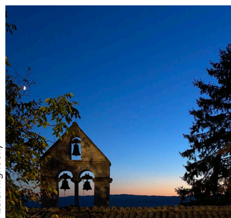
Assisi night sky